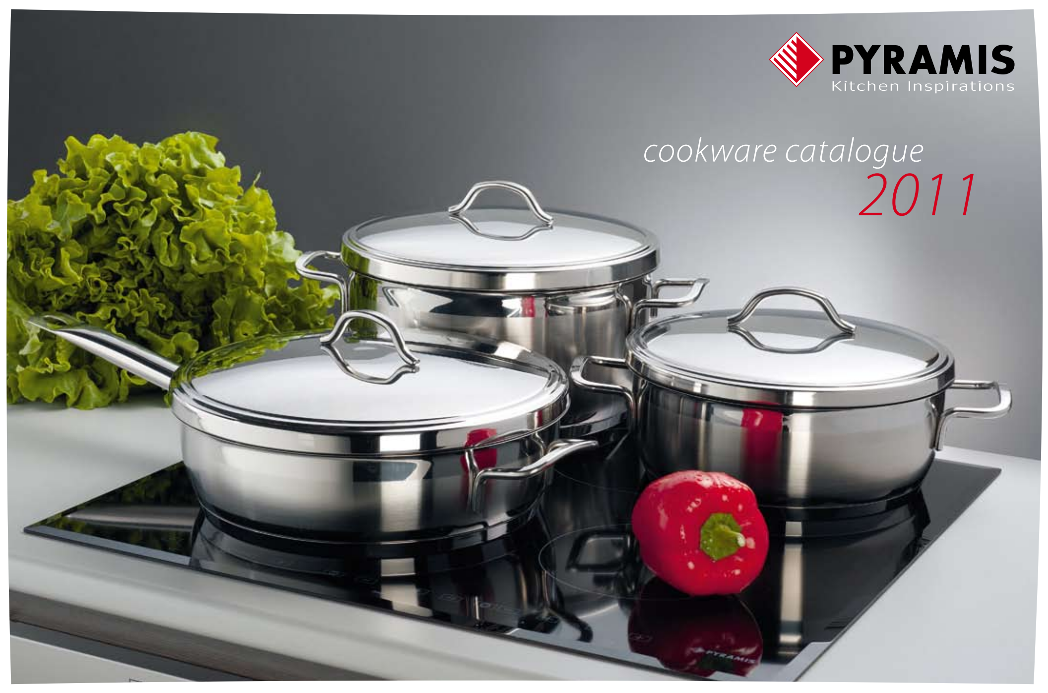
Studio · Classic · Zeon · Expert Plus · Logic Plus · Gourmet · Linea · Evergreen · Ceratech · Olympia · Kitchen Accessories